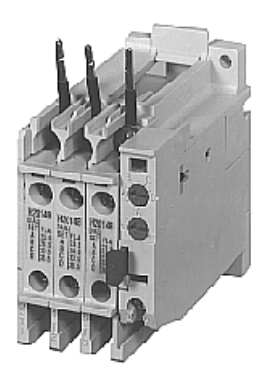
Series B1 32A Overload