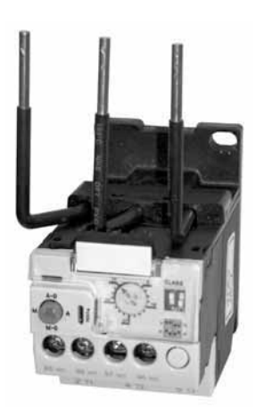
C396 Electronic Overload

Fuses and Inverse-Time Circuit Breakers may be selected per Article 430, Part D of the National Electrical Code to protect motor branch circuits from fault conditions. If higher ratings or settings are required to start the motor, do not exceed the maximum as listed in Exception No. 2, Article 430-52.